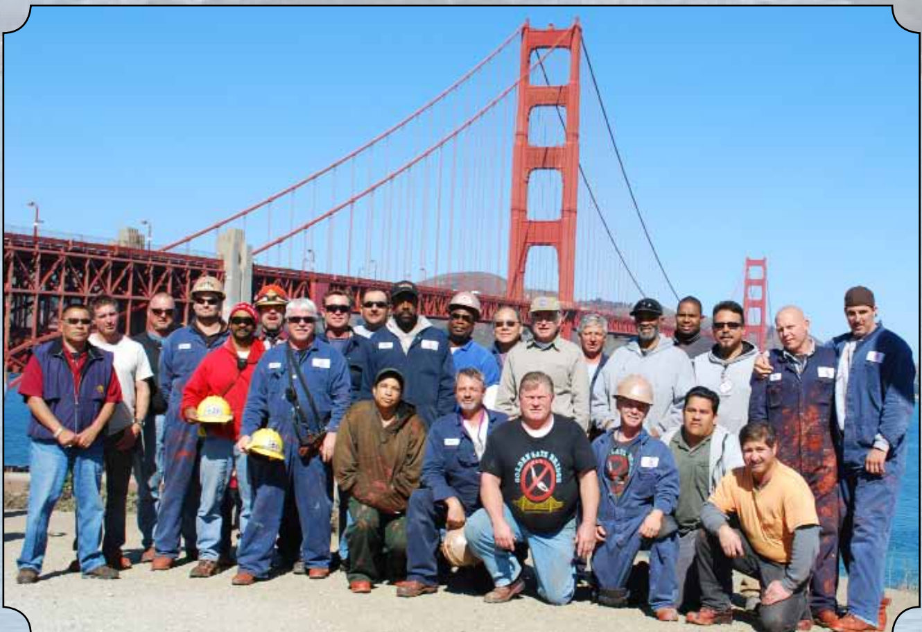
District Council 16 is proud to introduce the Golden Gate Bridge Painters

Efforts to begin the construction on the bridge began as early as 1928. The process would entail the efforts of six counties in Northern California. In 1928, the counties formed a Golden Gate Bridge and Highway District. In 1930, the voters appropriated a 35 million bond issue to finance the building of the bridge. For many years following, Joseph Baerman Strauss, a distinguished engineer, dreamed of raising a span across the Golden Gate. It was in response to his vision that people first started saying that the bridge could not be built. But, amazingly enough Strauss held fast to his vision, and a span was eventually raised across the Golden Gate. The actual work on the bridge began on January 5, 1933. It was completed four-and-one-half years later. The result astounded the fiercest of Strauss’ critics. To this day, the bridge is admired for its magnitude and beauty.